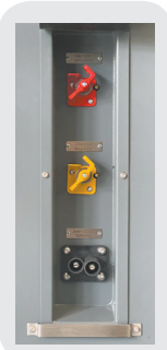
Fitted with isolators & Jump Start Terminal